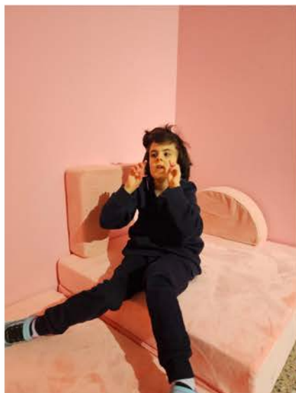
Ariya at ACE gallery

On May 8, students visited the interactive Push/Pull: You Can Touch This exhibition at ACE Gallery. They enjoyed hands-on textile activities, costumes, and sewing supported by SASSVI. Highlights included experimental sound installations, projected video stories, and the popular pink room filled with hanging textile tubes and soft cubbies. The experience brought contemporary art to life and connected with students' classroom learning.